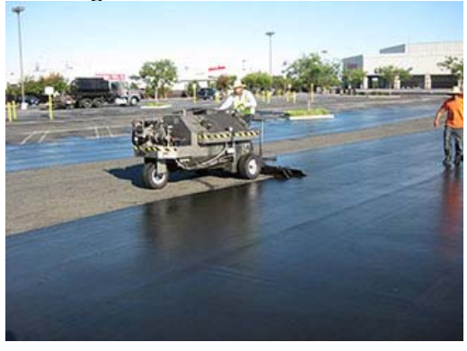
Slurry Surfacing (Cal-Trans 37.3)

Sealcoats or maintenance seals are generic terms for any of a number of surface coatings or asphaltic sealers, all aimed at protecting against moisture intrusion and raveling. Common brands are TA-1000, Guardtop, Overkote, Sealmaster, etc.